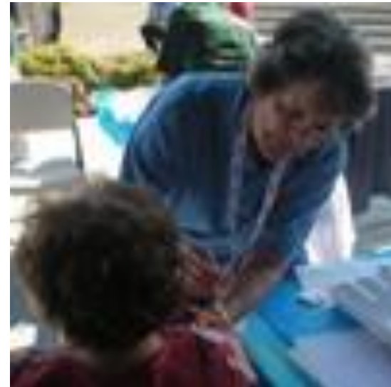
Lowcountry MRC (SC) A volunteer gives a flu shot during Senior Day at a 2009 fair.